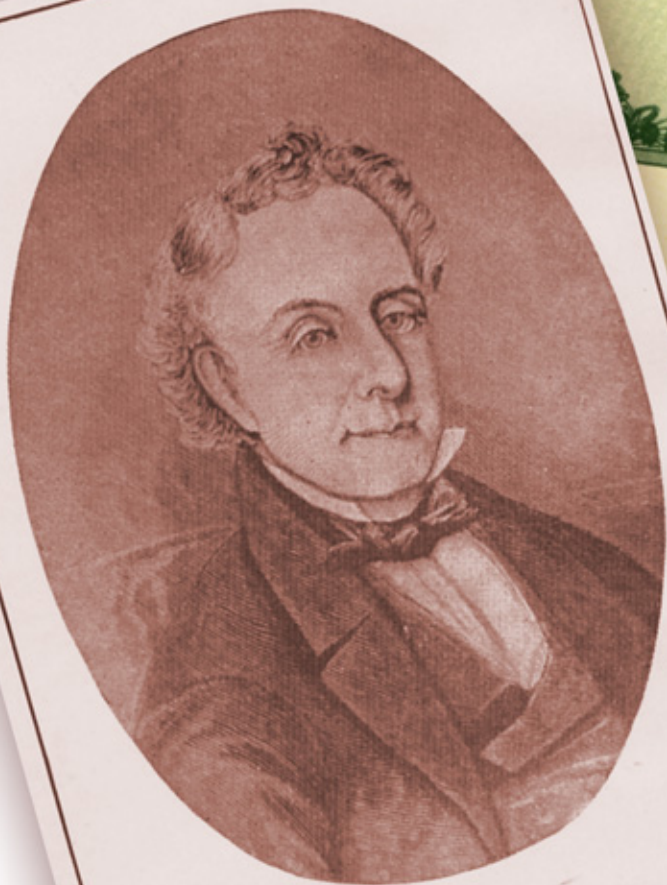
Colonel Talbot, 1771 - 1853